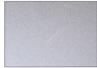
Figure 3— Small scratches may “disappear” in a self-healing clearcoat.