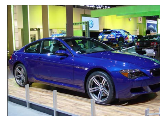
Figure 2– This BMW M6 has powder clearcoat from the factory.