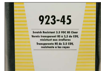
Figure 4— Glasurit offers this self-healing clearcoat.