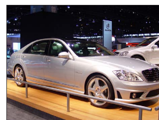
Figure 1– Mercedes-Benz uses nano-particle clearcoat.

Nano-particle clearcoat uses nanotechnology. What is this? Nanotechnology is a scientific research field that uses very small microscopic particles (nano-particles) to build larger, complex structures. In the case of automotive clearcoats, the nano-particles are made of ceramic. When the nano-particle clearcoat is applied, the ceramic nano-particles create a very hard, tightly cross-linked structure when the clearcoat cures, making it very durable. Mercedes-Benz introduced nano-particle clearcoats on their vehicles in 2004, and uses it currently for production (see Figure 1). Benefits include higher resistance to micro-scratching, such as from car wash brushes. Also, better stain resistance caused from debris such as tar, rail dust, and even bird droppings is another advantage of using nano-particle clearcoat.