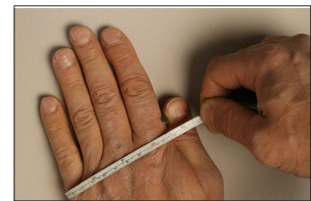
Figure 4– To find the size glove for you, measure your hand around the knuckle area and add one inch.