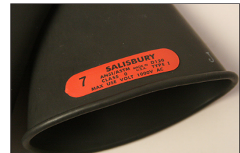
Figure 3– There is several information on a label on the cuff of each glove.