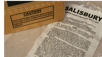
Figure 2– Requirements for testing and care for the gloves are outlined on the plastic bag and box where the gloves are packaged.

OSHA also specifies that an air test should be done in the field before each use, and at other times if there is cause to suspect any damage. The ASTM standard specifies that an air test can be done by holding the glove by the cuff and rolling the gloves gently toward the fingers to form an air pocket inside the glove. While the air is entrapped, check the gloves for punctures or checking, listen for escaping air, and hold the gloves up against your cheek to feel for escaping air. If the glove will not hold pressure, the glove is damaged and should not be used. The air test can also be done with a mechanical inflator. On the higher classes